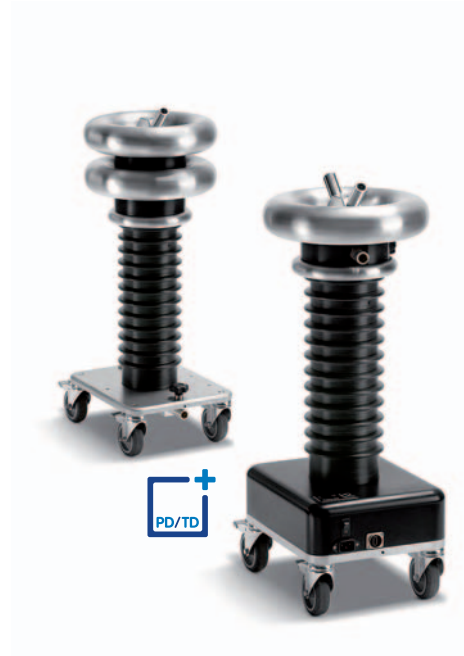
PDTD60-2 Partial Discharge system with integrated Tan Delta unit