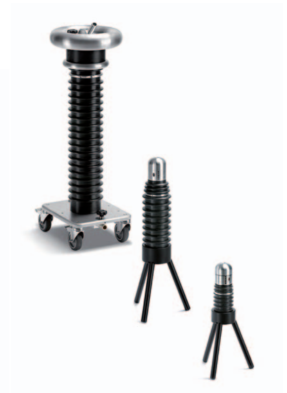
TD30 / TD60 / TD90-MC external Tan Delta diagnostics systems