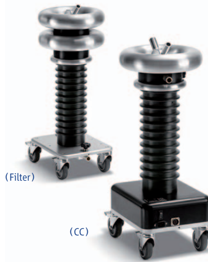
PDTD60-2 Partial Discharge system with integrated Tan Delta unit