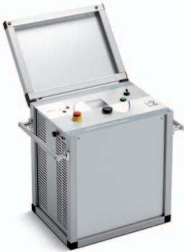
HVA60 VLF Hipot Tester