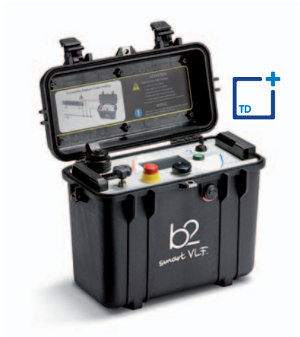
HVA28TD with integrated Tan Delta diagnostics system