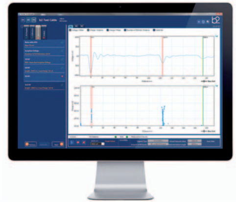
b2 Suite® – Software for testing, diagnostics, data management and control of hardware